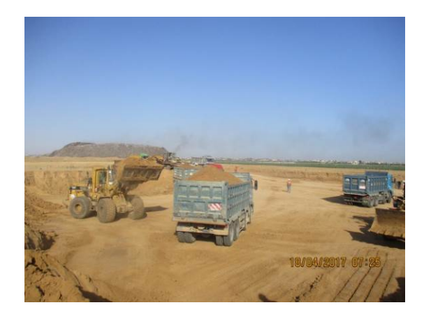
Excavation Works at KY WWTP Site on 13 & 18 April 2017