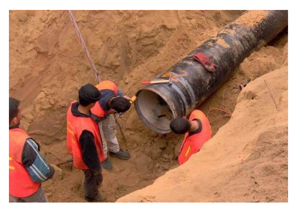
Installing the Main Inlet Pressure Line (Completed)