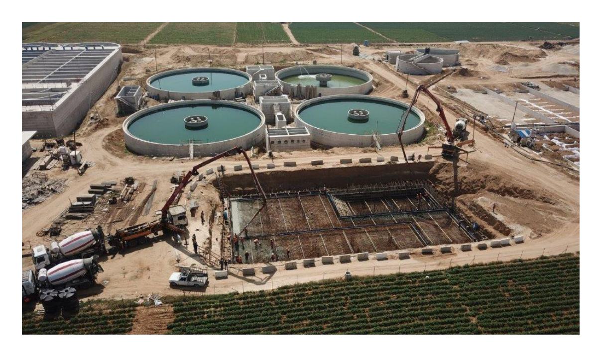
Steel Reinforcement and casting Concrete for the Sand Filter in March 2018