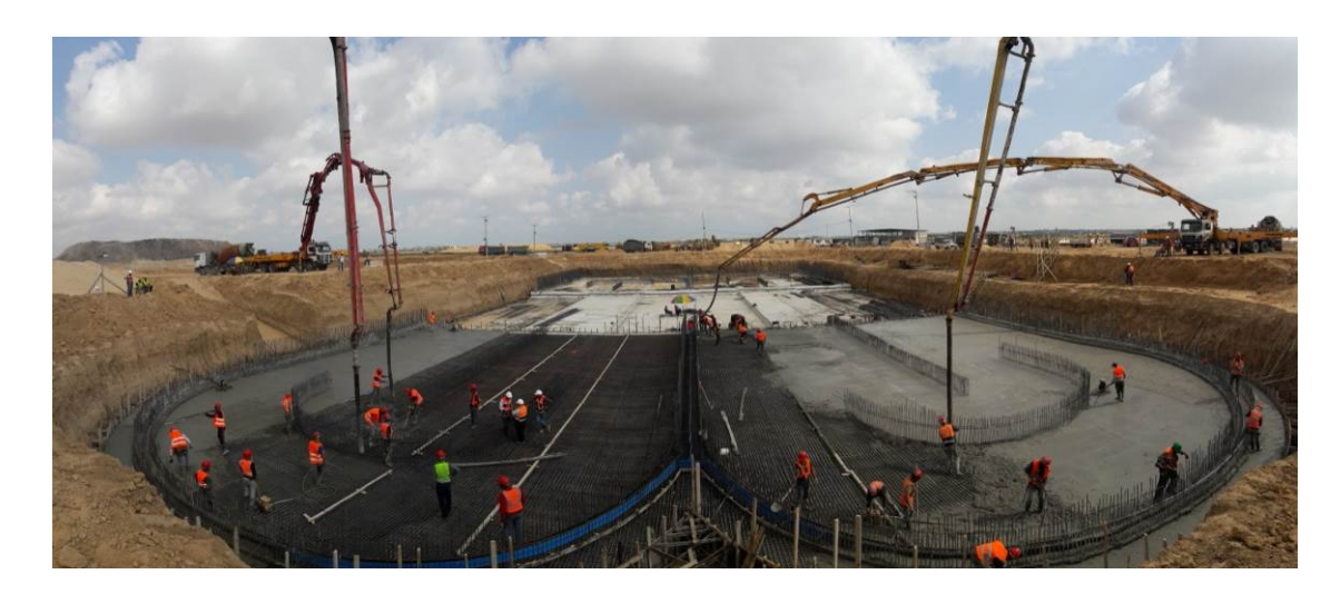
Casting Reinforced Concrete for the Foundation of the Aeration Tank on 20 June 2017