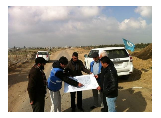
Site Handing Over for ITB 2016-158 and ITB 2016-219-UNDP on 18 January 2017