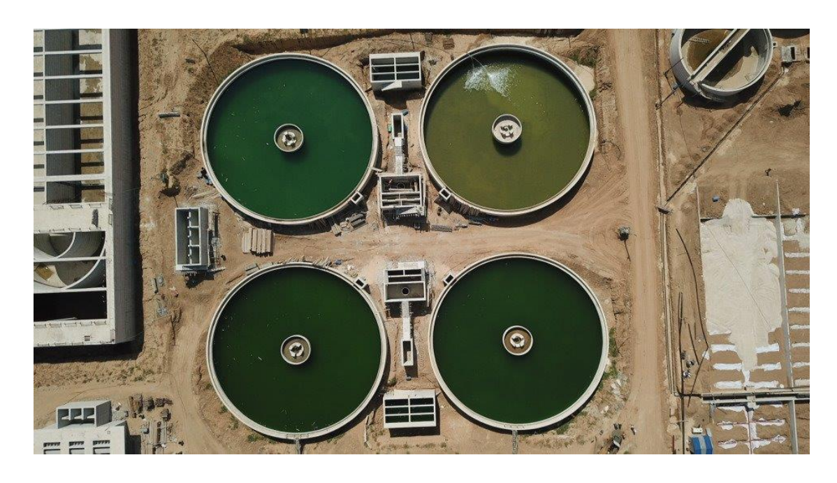
Casted Reinforced Concrete and Water Tightness Test for the Clarifiers in March 2018