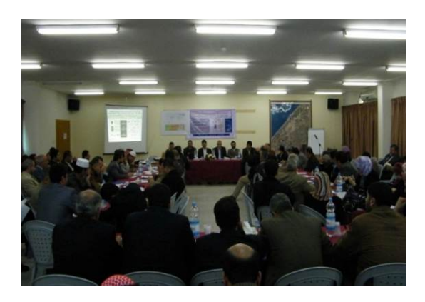
Public Hearing Meetings & EIA Public Hearing Workshop (EIA Study Completed)