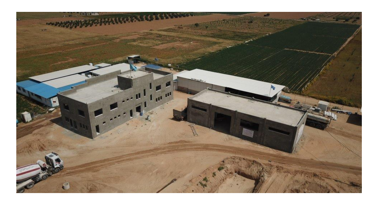
Executed Works for the Admin Building and Workshop in March 2018