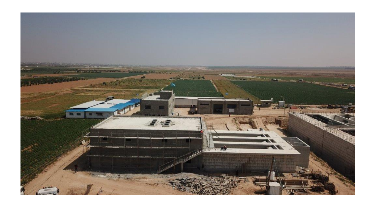
Casted Reinforced Concrete for the Pre-Treatment Building in March 2018