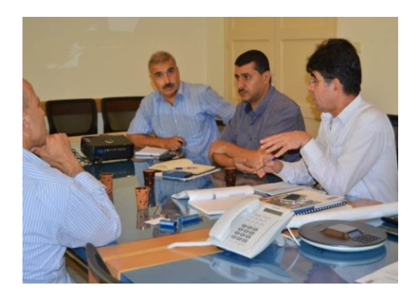
Kick-off meeting of the design review, pre-contract and construction supervision services in UNDP Gaza Office on 11 August 2015