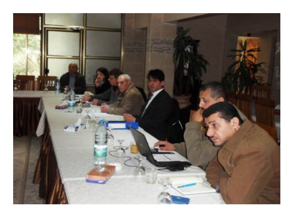
Joint milestone workshops to discuss the design review in Gaza on 02 December 2015, and on 07 & 08 February 2016